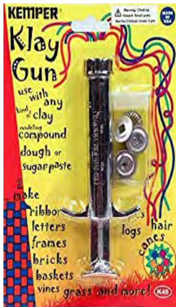
Mini Clay Gun with Dies 40304 K45 $16.99