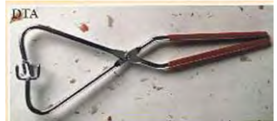
40279 Dipping Tongs (DTA) $11.69