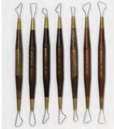
8R1 8R2 8R3 8R4 8R5 8R6 8R7