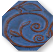
O-23 Sapphire Blue