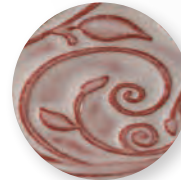
O-54 Dusty Rose