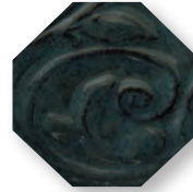
O-2 Black Tulip