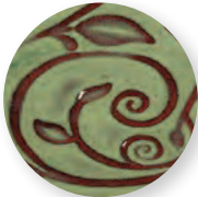
O-42 Moss Green