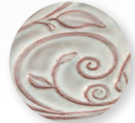
O-11 White Clover