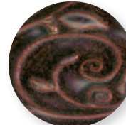
O-57 Mottled Burgundy