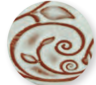
O-10 Transparent Pearl