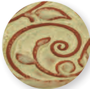
O-30 Autumn Leaf